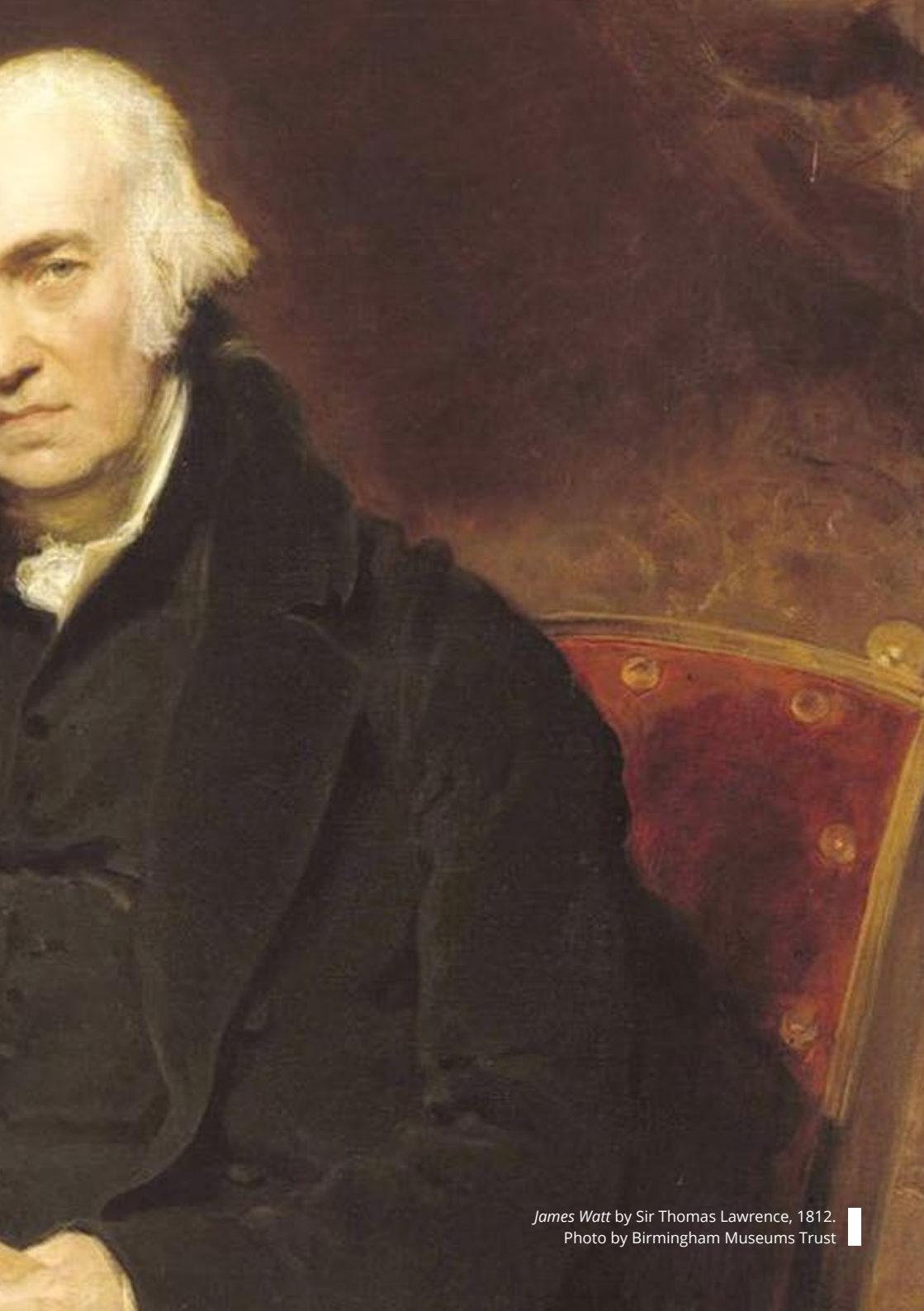
James Watt by Sir Thomas Lawrence, 1812.