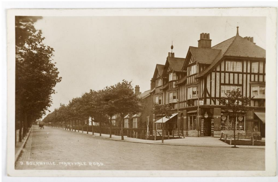
1995V632.1146; 'Bournville, Maryvale Road'; Purchased from Roger Kesterton.