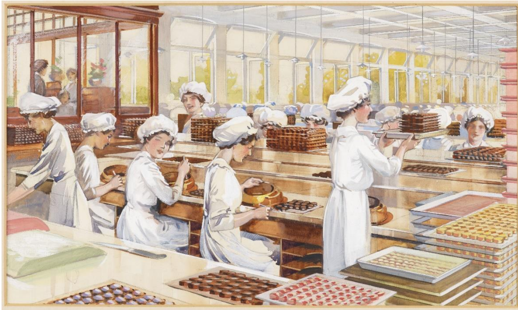
1980P92; 'A Bournville Workroom (decorating department)', 1910;

Attributed to: H N Bradbear;