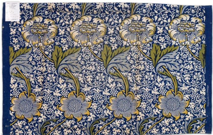
Left: 'Kennet', Wallpaper design by William Morris, 1883; 1941P404. Above: 'Kennet', William Morris, Morris & Co, 1883; 1941M405. Both presented by the Friends of Birmingham Museums & Art Gallery, 1941.

Among my favourite items of the many which I have come across is the collection of William Morris drawings of his designs with the accompanying fabrics and wallpapers. These were, incredibly, purchased in 1941. The Museum must have had faith that we would win WW2!