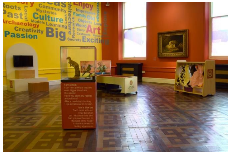
BMAG's Mini Museum