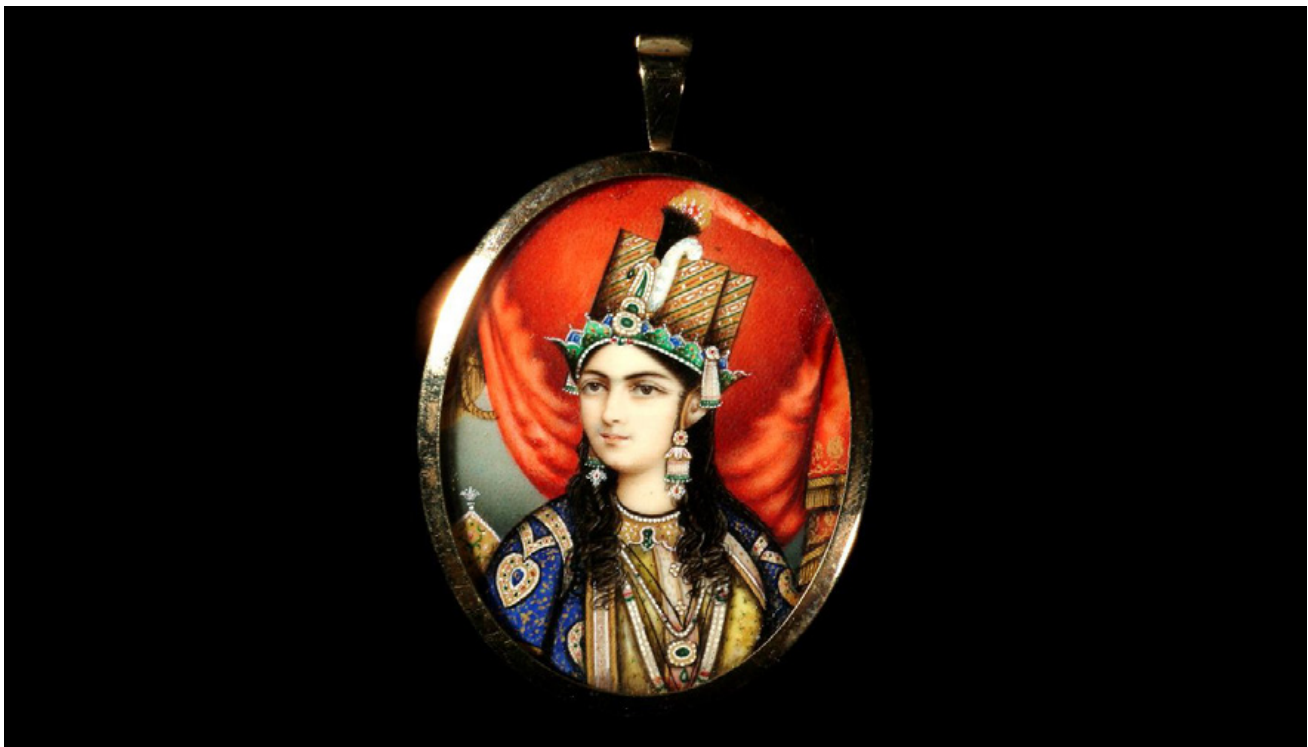
'Portrait of Mumtaz Mahal', Artist unknown, 1840-1890, Presented by the Friends of Birmingham Museums & Art Gallery in 1932; 1932P240, Birmingham Museums Trust | Image Details - 1932P240 Portrait of Mumtaz Mahal