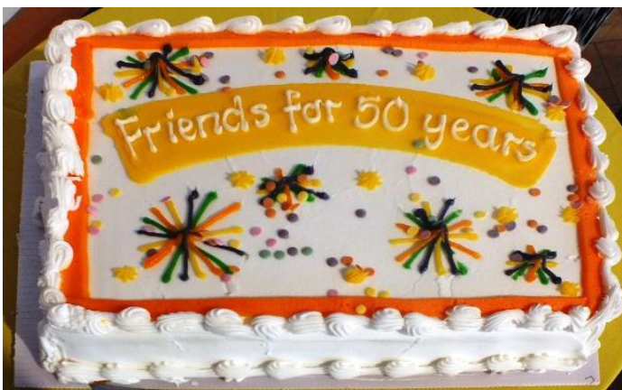
The Friends' Golden Jubilee cake

From a handful of enthusiastic members fifty years ago the Friend's membership has blossomed to currently over 500 members.