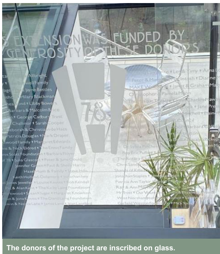
The donors of the project are inscribed on glass.

78 Deringate is not to be missed. I was most impressed both by the House and the volunteers and students doing work experience there!