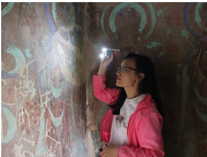
Inside one of the many caves

Grotto murals are the product of cultural exchanges between the East and the West on the Silk Road. They are a precious cultural heritage of China and an important cultural heritage of the world. After the completion of copying of these murals, they will be collected by major museums of China, so that more people can see the beauty of ancient cave murals in the cities.