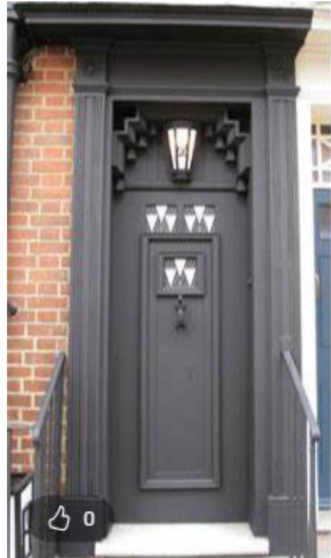
Front door of 78 Derngate