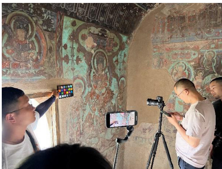
Members of the team produce an exact photographic record on site

300-AD1900). We visited temples, caves, and museums in 11 different locations. Many of these murals are precious relics of cultural and artistic heritage that have never been developed and never been opened to the public. These ancient murals in our investigation, research and reproduction are mainly based on religious themes. They were seen by people for more than 1,700 years. People used art to interpret religion and used paintings to make Buddhist scriptures intuitive and easy to understand, allowing people to be inspired by art enlightenment.