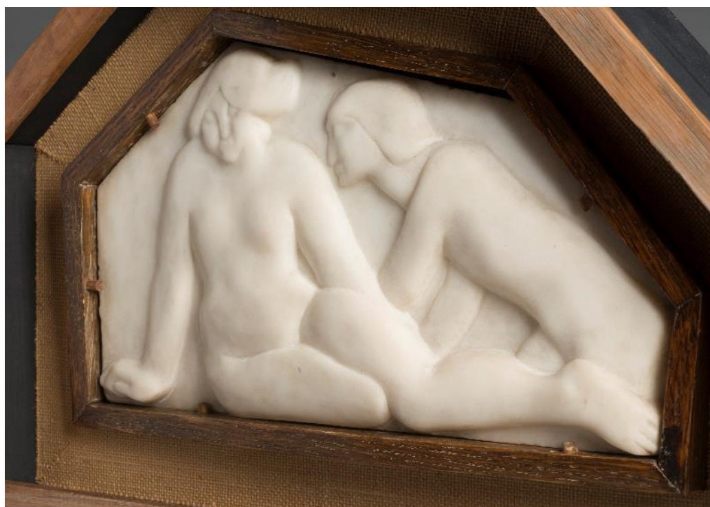
Henri Gaudier-Brzeska, Scene Amoureuse, Serravezza marble, 1914 Gift of The Contemporary Arts Society to Heritage Doncaster

Collections and Exhibitions Officer Heritage Doncaster