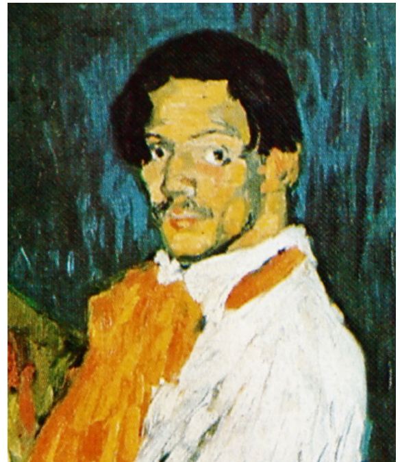
Pablo Picasso self portrait.