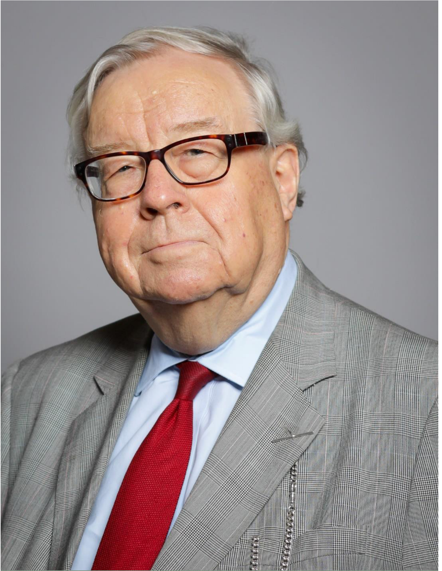
Baron Cormack of Enville in the County of Staffordshire