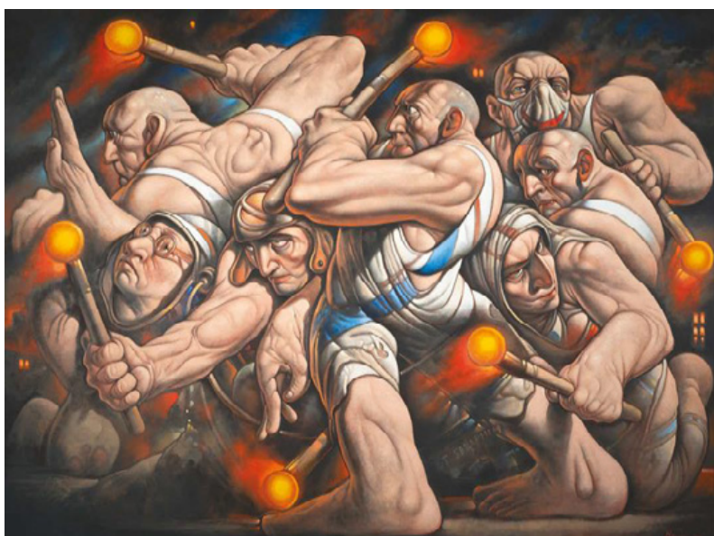
Peter Howson, Wagner

Many of the works exhibited were inspired by Howson's ongoing faith journey, including the Stations of the Cross series. His graphic responses to recent global events including the covid pandemic and the Ukrainian war were moving and sometimes brutal. His work is clearly painted with feeling and emotion much of it conceived while he was in the depths of despair and at a very low ebb.