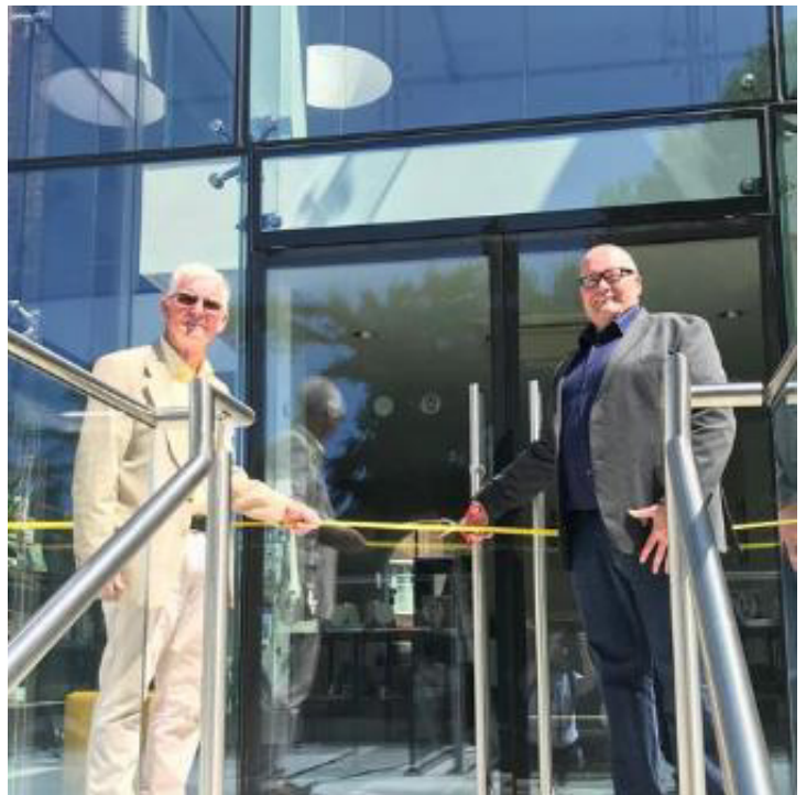
The cutting of the yellow ribbon