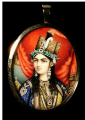
'Portrait of Mumtaz Mahal', 1840-1890, Artist unknown; Presented by the Friends of Birmingham Museums & Art Gallery, 1932, 1932P240