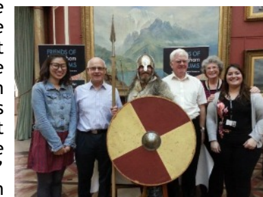
Friends Evening Opening at BMAG in July 2013 - with some Friends and the Anglo-Saxon soldier!